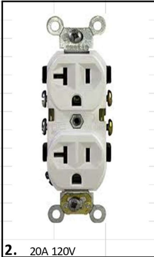
2. 20A 120V