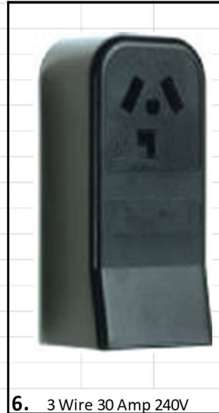
6. 3 Wire 30 Amp 240V