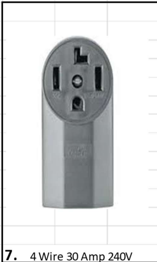
7. 4 Wire 30 Amp 240V