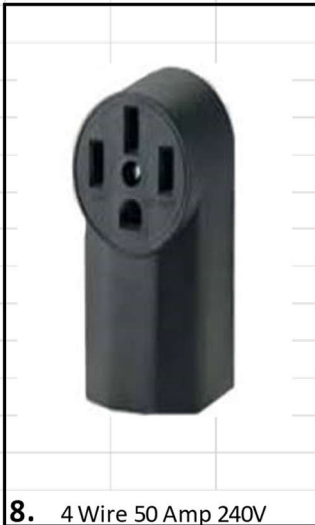
8. 4 Wire 50 Amp 240V