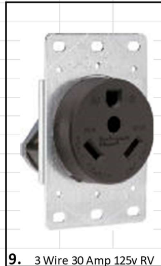
9. 3 Wire 30 Amp 125v RV