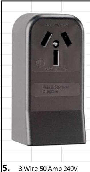
5. 3 Wire 50 Amp 240V