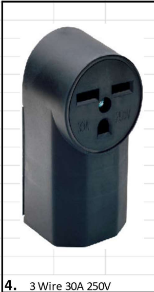
4. 3 Wire 30A 250V