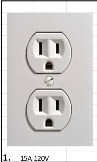
1. 15A 120V

HONORING OUR POLICE, FIRE, RESCUE & EMERGENCY PERSONNEL