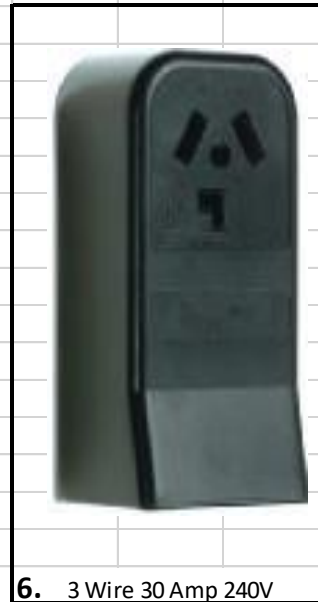
6. 3 Wire 30 Amp 240V