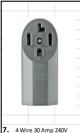
7. 4 Wire 30 Amp 240V