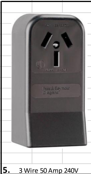
5. 3 Wire 50 Amp 240V