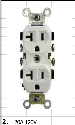
2. 20A 120V