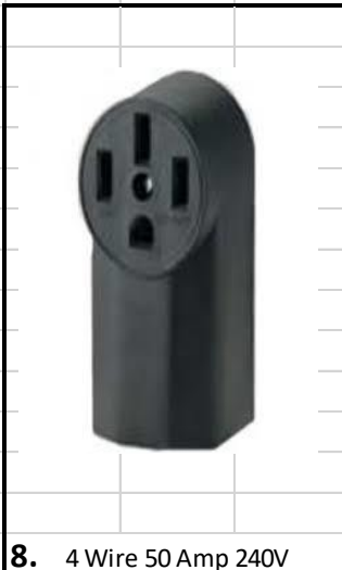
8. 4 Wire 50 Amp 240V