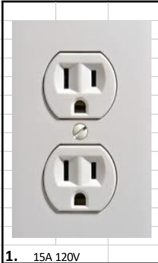
1. 15A 120V

HONORING OUR POLICE, FIRE, RESCUE & EMERGENCY PERSONNEL