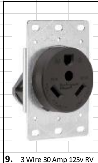
9. 3 Wire 30 Amp 125v RV