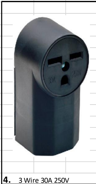
4. 3 Wire 30A 250V